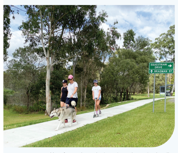
New footpaths make it easier to be active locally.

The most requested footpath in Division 11 has now been completed on Equestrian Drive!