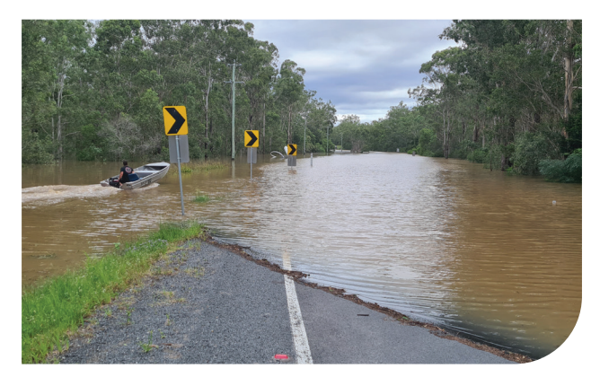
Division 11 was hard hit by flooding across the City of Logan earlier this year.

Responses in Council's 'Have Your Say' online survey, which closed on 29 May, will also be used to help make these important decisions for our community.