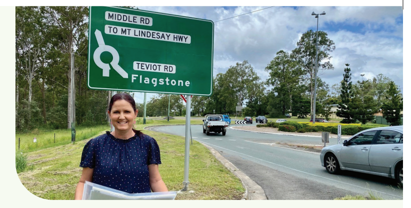
The first stage to upgrade the Teviot Road and Middle Road intersection will start soon.

I understand the frustration motorists have driving through this roundabout and this section of road because the current roundabout no longer meets the needs of our growing population.