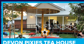
DEVON PIXIES TEA HOUSE