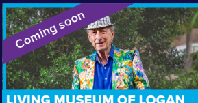
LIVING MUSEUM OF LOGAN