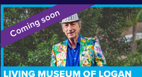
LIVING MUSEUM OF LOGAN