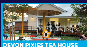
DEVON PIXIES TEA HOUSE