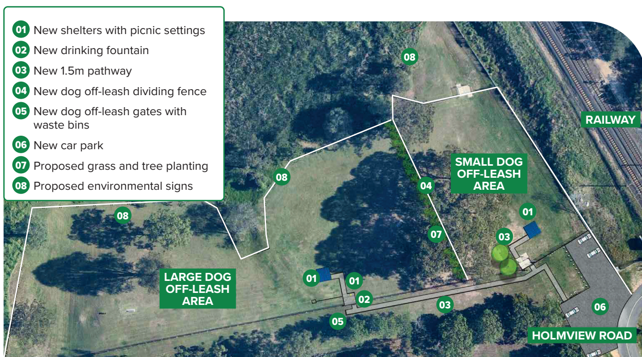
Grove Road Reserve

The Grove Road dog off-leash area has been upgraded in response to community requests, thanks to funding from the Division 6 Local Infrastructure Program (LIP).