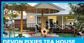
DEVON PIXIES TEA HOUSE