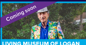
LIVING MUSEUM OF LOGAN