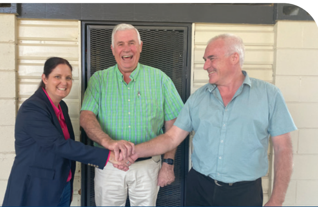
Excited Middle Green committee members receiving the news of the upgrade.

For those new to the area, Middle Green is at 720–768 Middle Road, Greenbank. It is home to the Greenbank Raiders Rugby League Club and many more community groups.