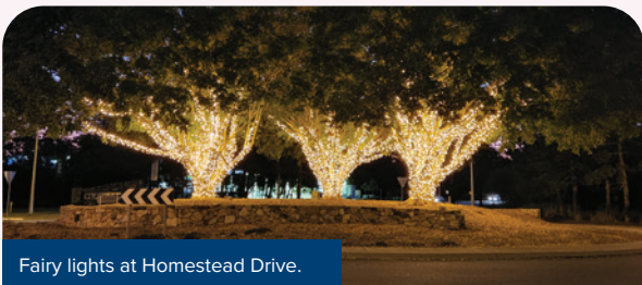
Fairy lights at Homestead Drive.

The fairy lights at Homestead Drive, Flagstone, are part of a beautification project that has been a long time coming. The fig trees are an iconic entry way to Flagstone and over the years I have had plenty of requests to light them up. Since the installation, I have had so many positive comments, and I know that it puts a smile on my face when I drive through at night and see it all lit up. With Christmas just around the corner, the trees will also have Christmas decorations placed on the roundabout, which I'm sure will look spectacular.