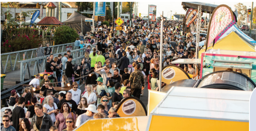
2022's FLAME was huge for Jimboomba – and it's coming back!