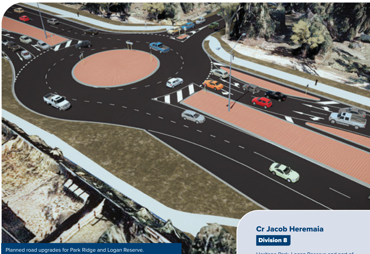
Planned road upgrades for Park Ridge and Logan Reserve.

I'm proud to be a part of a community that values progress and safety, and I look forward to seeing these projects get built.