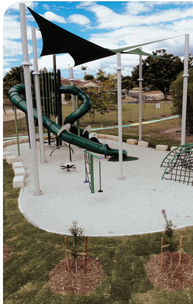
The new adventure playground in Heritage Park.

This project not only enriches the lives of our community members but also underscores our commitment to creating vibrant, welcoming spaces that bring joy, recreation, and togetherness to our neighbourhood.