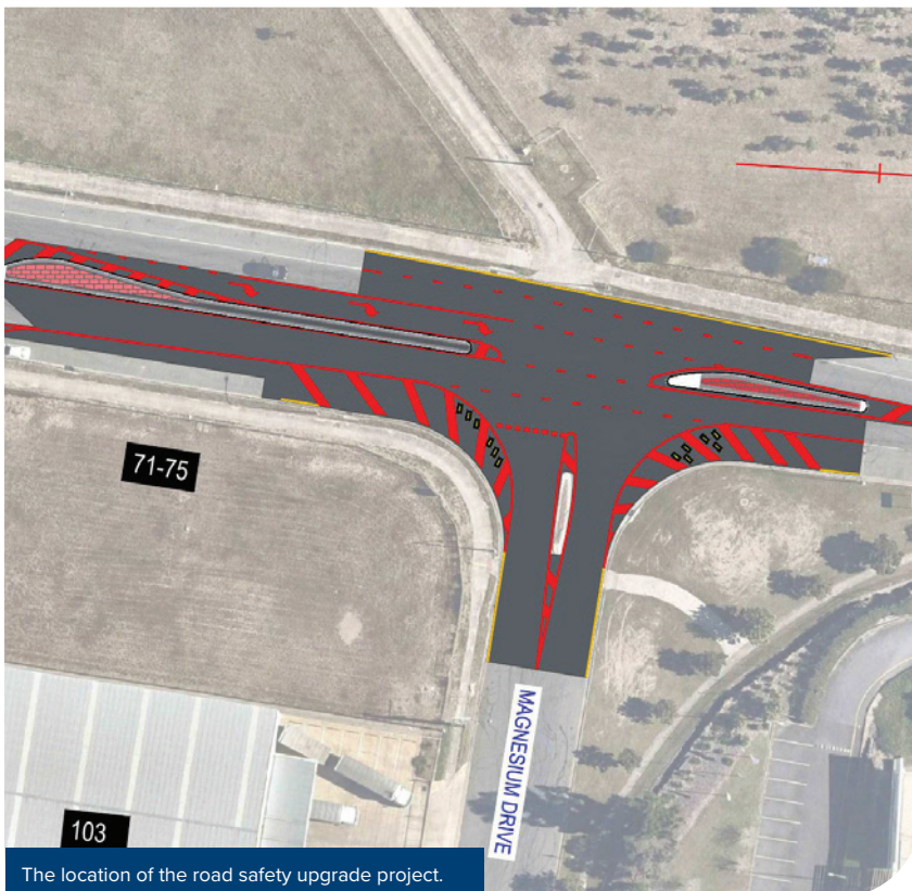
The location of the road safety upgrade project.