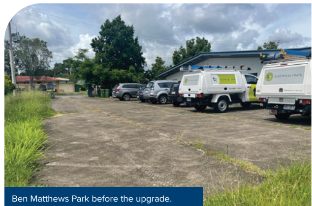
Ben Matthews Park before the upgrade.

I am proud we have achieved these things together and look forward to delivering more services!