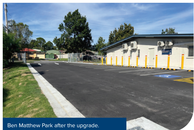
Ben Matthews Park after the upgrade.