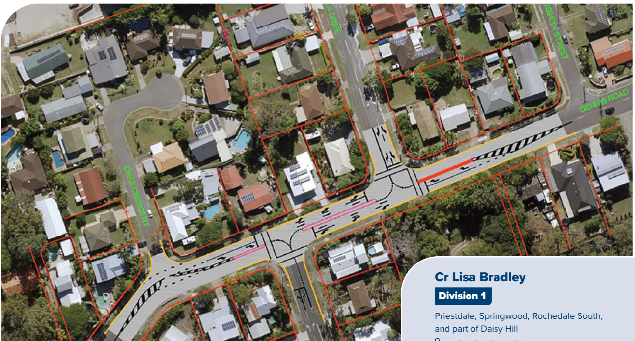
The Dennis Road, Cinderella Drive and Barbarella Drive intersections.

As part of this enhancement, Council will also separate traffic movements between Dalton Court and Springwood State High School to enhance pedestrian safety. This includes reprogramming the traffic signal to accommodate the new signal phasing sequence as well as modifying line markings and installing additional traffic signal lanterns.