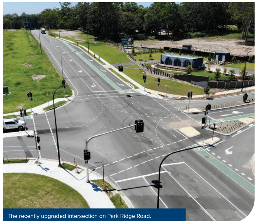
The recently upgraded intersection on Park Ridge Road.