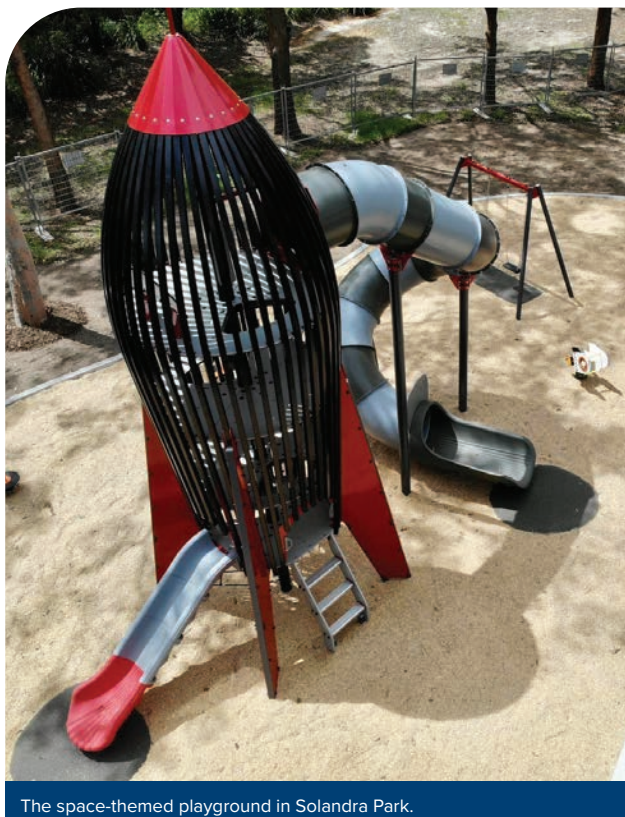
The space-themed playground in Solandra Park.