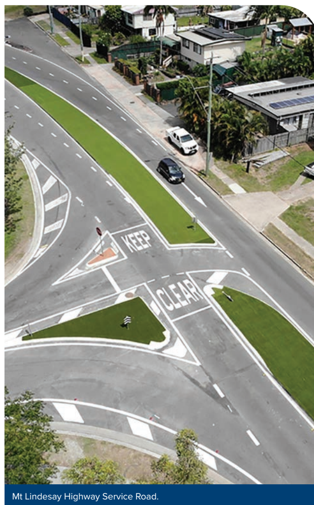
Mt Lindesay Highway Service Road.

For information on the broader Mt Lindesay Highway Upgrade Program, visit the Queensland Department of Transport and Main Roads' official website.