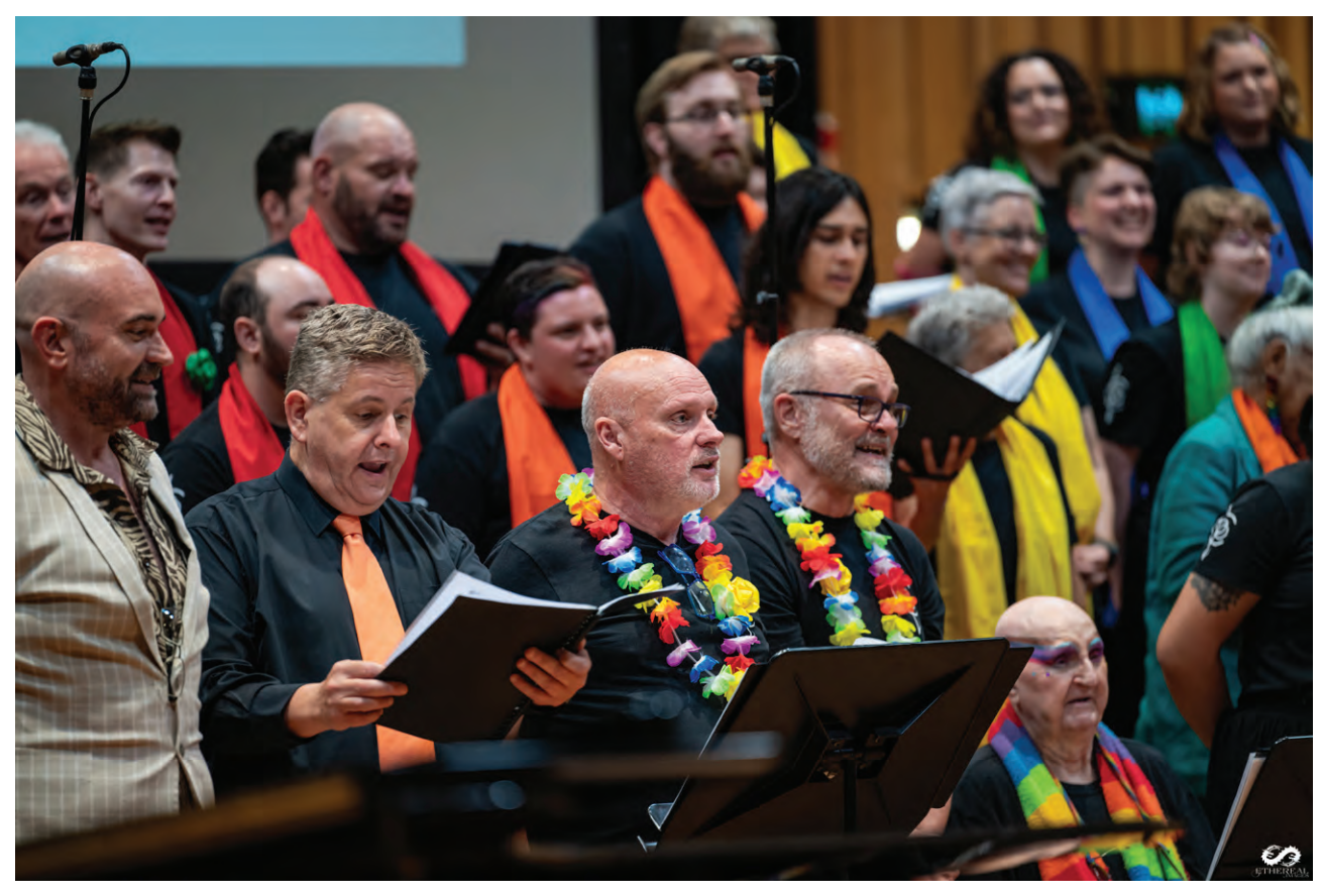
The Brisbane Pride Choir putting their vocal talents to work during a performace.

Loud & Proud Logan is supported by Logan City Council and the Queensland Government via the Investing in Queensland Women Fund and Creative Australia through the Australian Cultural Fund. It's also supported by Bulk Nutrients and Pride Foundation Australia.