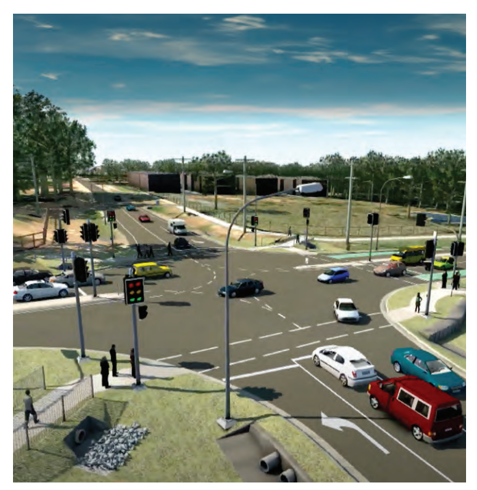
An artist's image of how the Park Ridge Road and Clarke Road intersection will look after upgrade works.