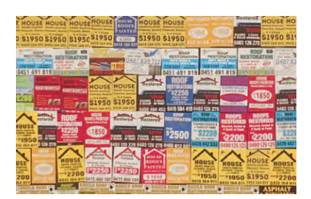
Some of the illegal signs removed since January.