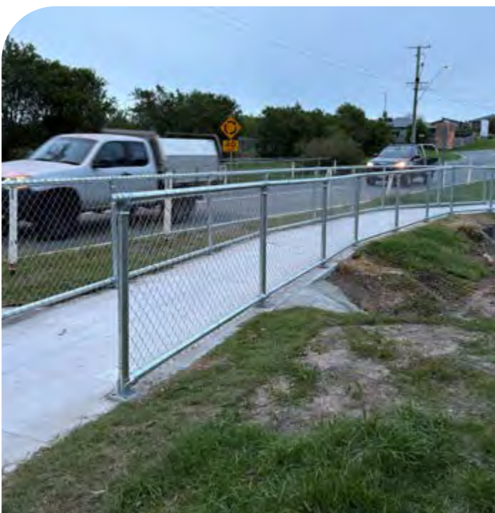
A safety fence is part of the new footpath along Green Road in Heritage Park.

I urge other residents to reach out to me through my email if you have any suggestions for important upgrades in your area.