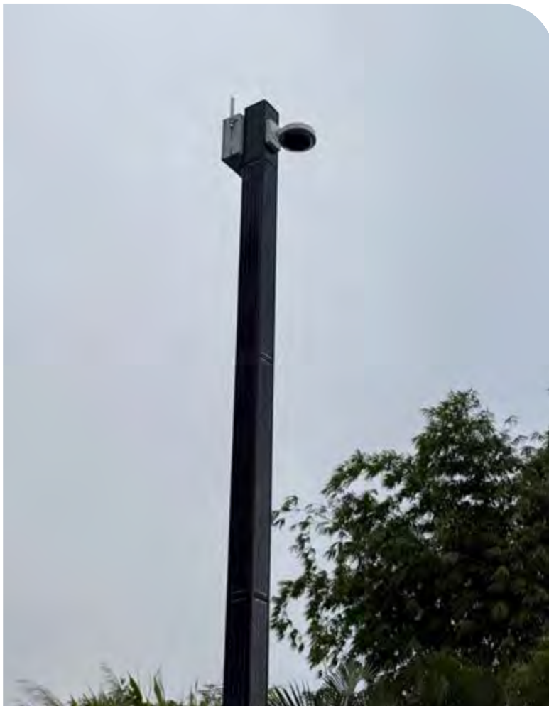
The new mobile safety camera which will be deployed at locations across Division 8.

To learn more about the safety camera network and the location of cameras in Division 8, go to: logan.qld.gov.au/safety/safety-camera-locations