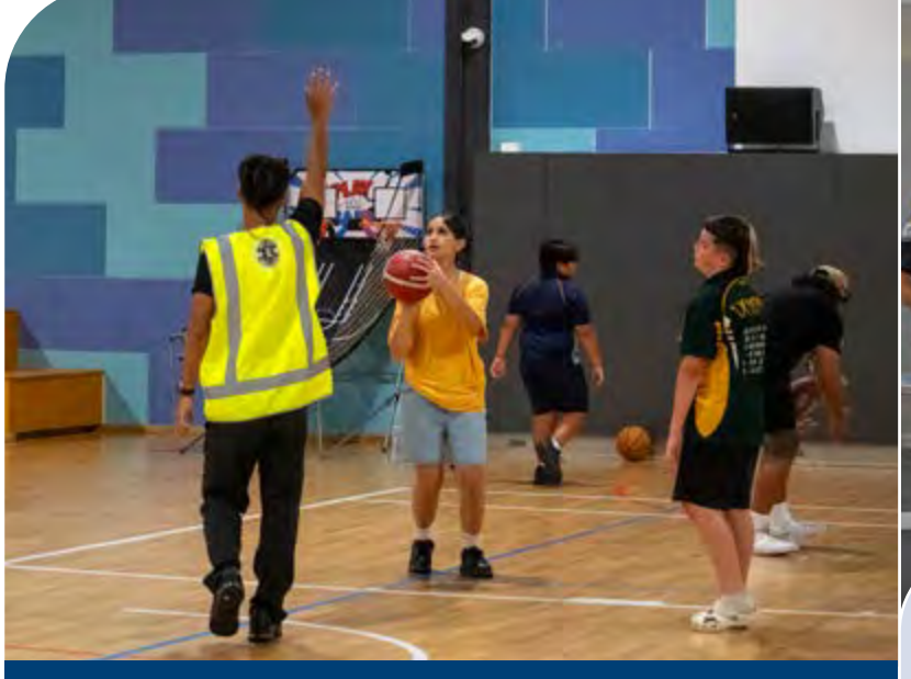
Teenagers can enjoy themselves in a safe and supportive environment at the Wilbur Street Youth Centre, where even local police liaison officers get involved in the fun.

All volunteers at the Wilbur Street Youth Centre are blue card holders.