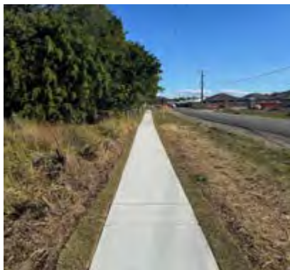
The newly laid section of footpath on Glen Road at Logan Reserve.

A missing footpath connection on Glen Road in Logan Reserve has now been completed.