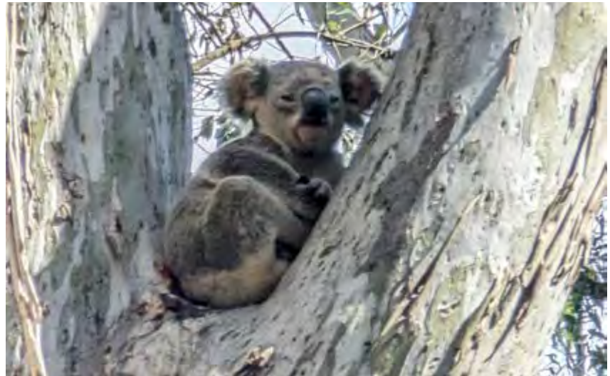
One of the koalas spotted recently at Alexander Clark Park at Loganholme.

These natural forested areas were given high-priority protection during the recently completed $6.34 million upgrade of park facilities, which