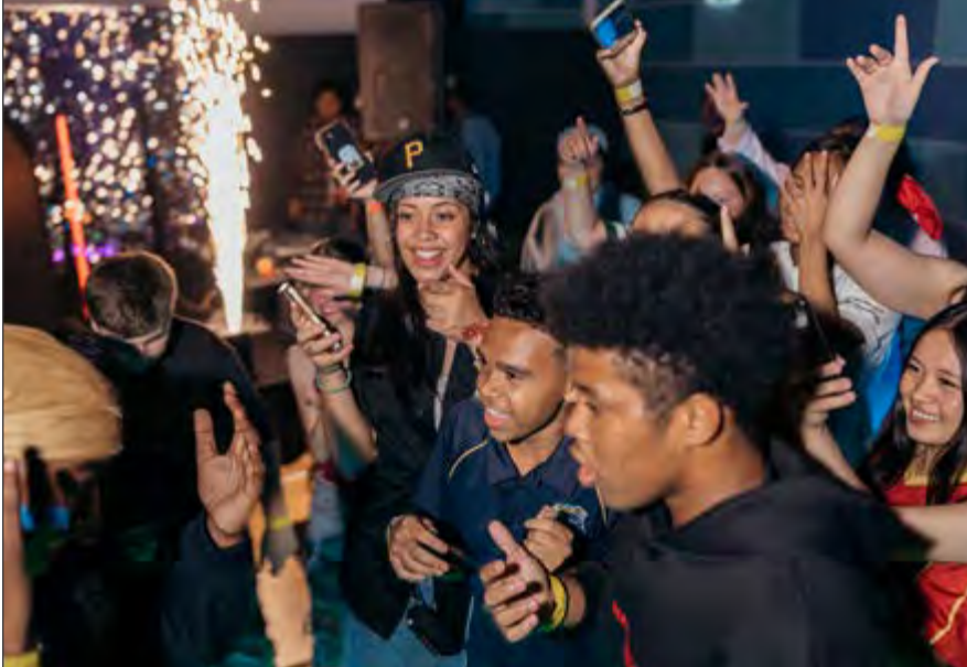
Teenagers enjoy the Wilbur Street Youth Centre vibe at the 'All Eyez On Me' 90s-themed party hosted by the facility earlier this year.

'Let me know your thoughts on what our newest skate park should look like.' See contact details below.