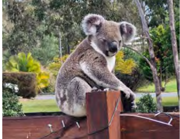
Leo was calm, but had to be collected by Mel Dunne of Rotary Club of SEQ Wildlife Rescue.

'The property owner took all the right steps, by immediately