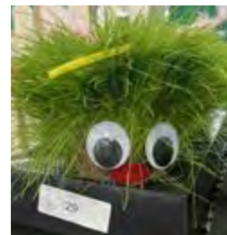
The winning creation, fully grown for the EKKA.

The young learners were hands-on with the competition entry, all helping to assemble the EKKApillar, and regularly attend excursions from their Loganholme kindy to the farm with keen interest.