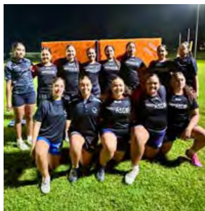
The Browns Plains Mets Under 14 girls team with the new tackle mats.