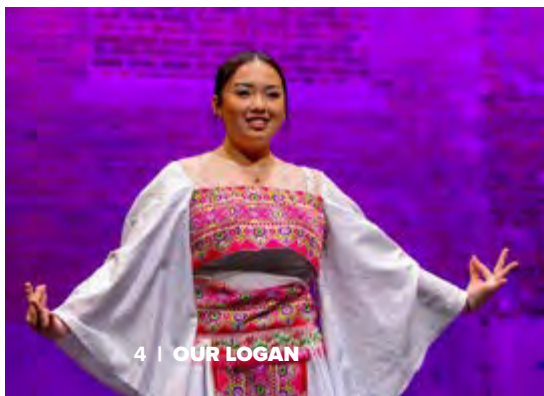
4 | OUR LOGAN