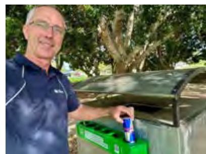
Containers for Change baskets have been installed across a number of Division 5 parks.