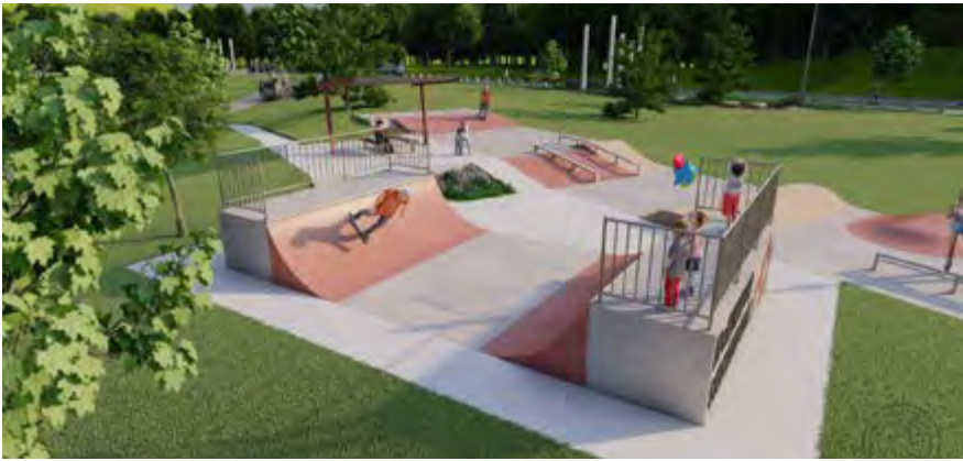
The 2 concept designs for a new skate park in Yarrabilba that went out to community consultation.