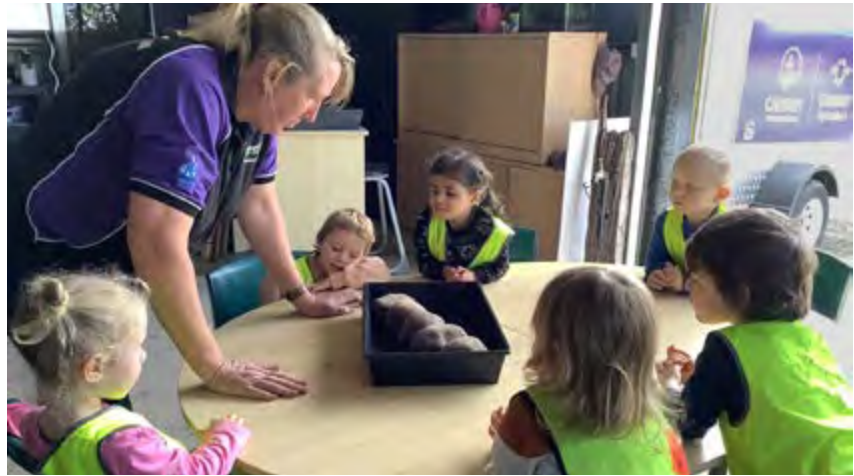
Children from the Hyperdome Early Education Centre learning how to grow their EKKApillar.