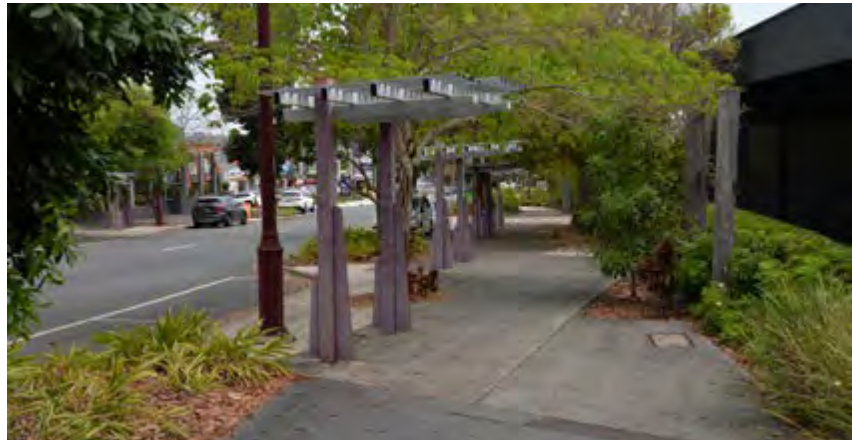
Additional streetscape upgrades are on the way for Fitzgerald Avenue in Springwood.

The works include the installation of new bench seating, which will be shaded not only by the existing trees but also new trumpet creeper vines ( Campsis radicans ), which in