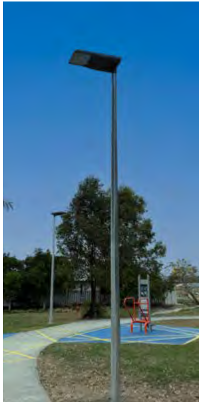
Two of the new solar-powered lights near exercise equipment in East Beaumont Park at Park Ridge.

'Installing these solar lights has addressed the concerns raised by the community and made our parks more usable.'