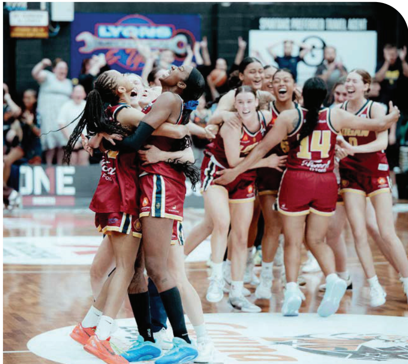
The Logan Thunder women's basketball team celebrate their 2025 Grand Final Series success.