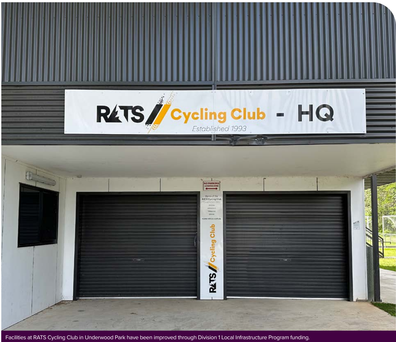
Facilities at RATS Cycling Club in Underwood Park have been improved through Division 1 Local Infrastructure Program funding.

The grant will also support the replacement of large trees, improving the amenity and long-term sustainability of the grounds.