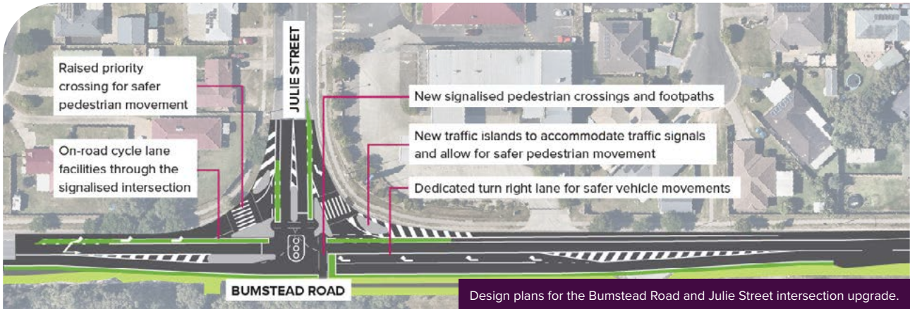
Design plans for the Bumstead Road and Julie Street intersection upgrade.