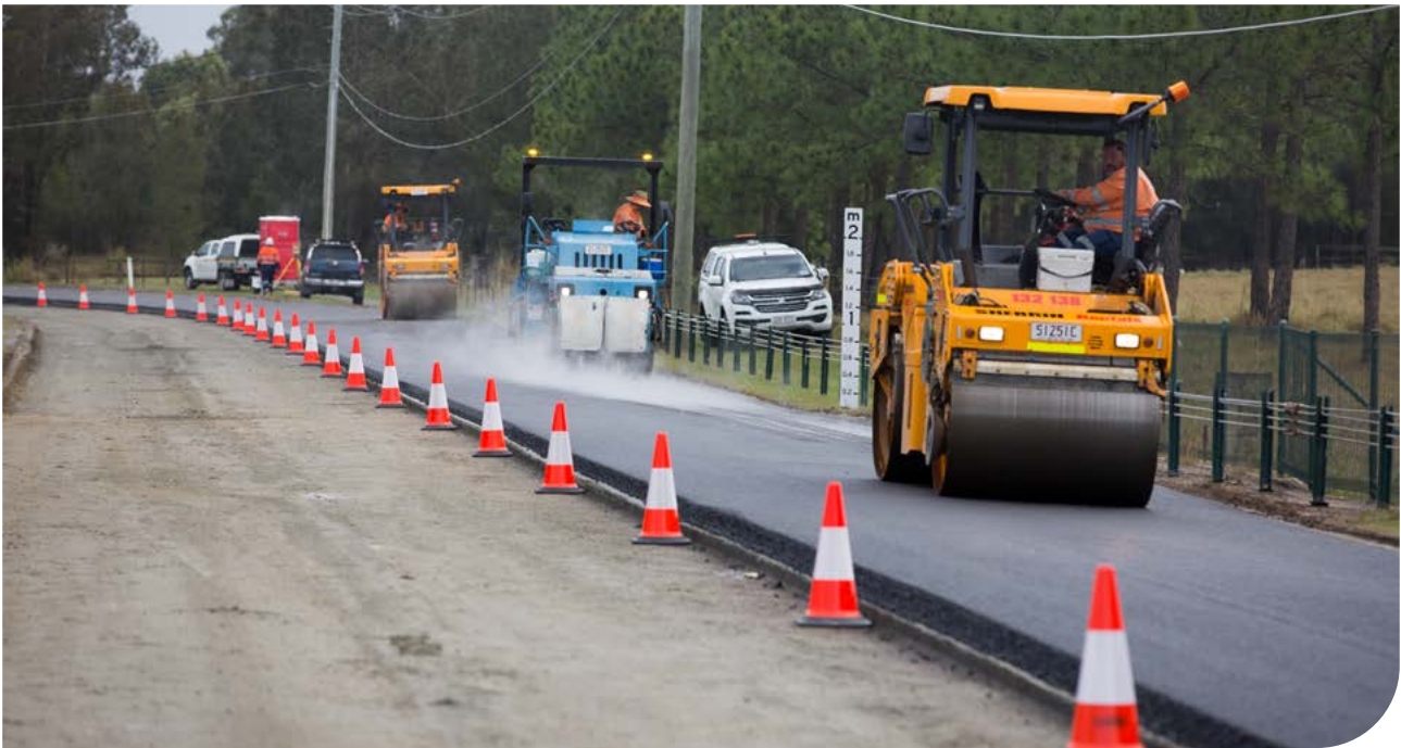
Regular resurfacing is important to help make our busy roads safer.