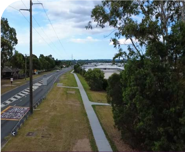
The new footpath along Logan Reserve Road helps make for safer access to the nearby school.

It's great to see Council delivering for our area and I'm working hard to have more delivered.