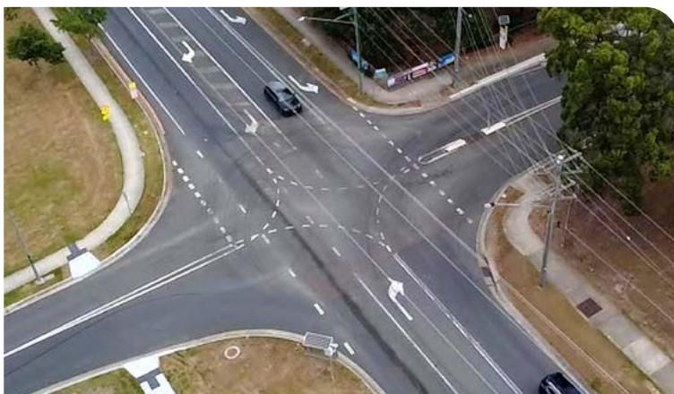
An upgrade is now underway for the busy Logan Reserve Road and School Road intersection.